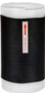
1.75" x 1.6" Cold Shrink 5410A5