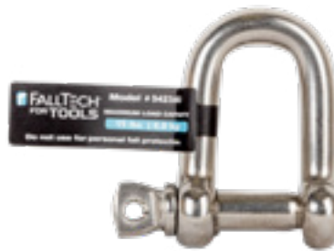
.8" x 1.5" Shackle 5423A2