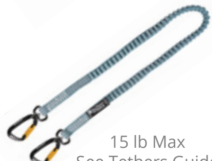
15 lb Max See Tethers Guide for Model #'s