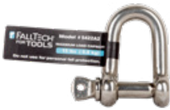
.65" x 1.25" Shackle 5422A2