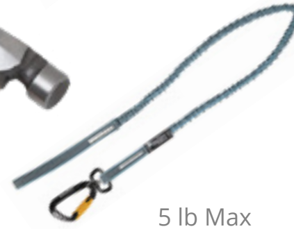
5 lb Max See Tethers Guide for Model #'s