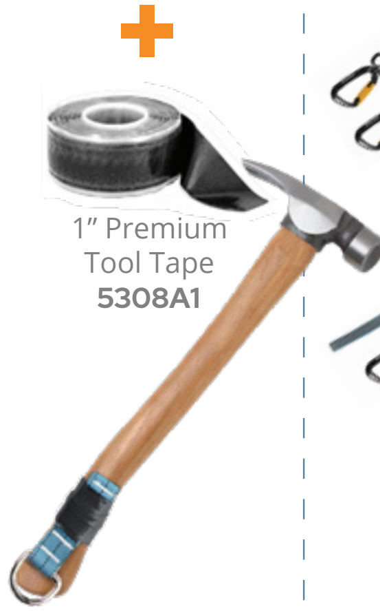
1" Premium Tool Tape 5308A1