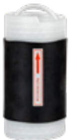
1.75" x 1.6" Cold Shrink 5410A5