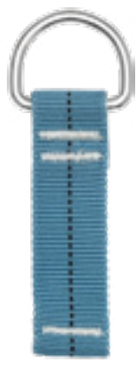
1" x 3 1/2" D-ring 5102A10 5 lb max