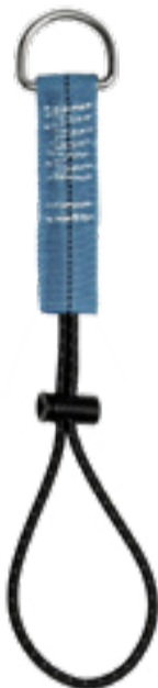
D-ring Choke-on Loop Attachment 5309A10