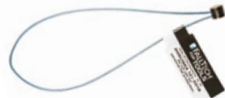
Choke-on Wire Loop 5317A10