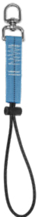
Swivel D-ring Choke-on Loop Attachment 5303A10