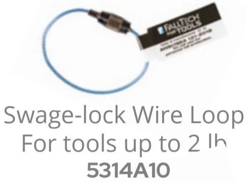
Swage-lock Wire Loop For tools up to 2 lb 5314A10